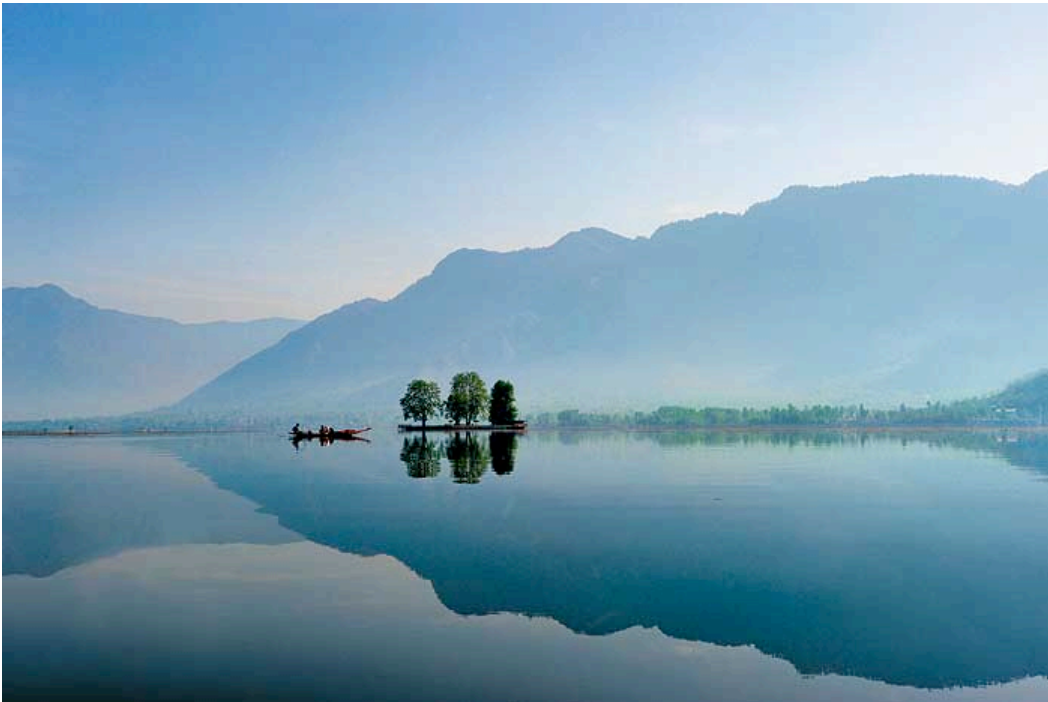
Zabarwan Mountains, overlooking Lake Dal and Srinagar, Kashmir

I venerate the supreme Śhiva located in the self, who can be known only in self-experience, who is devoid of the mental torment of fixation on any specific doctrine...I bow to the Benevolent One, the destroyer of the flood of conceptual constructs, free of the snare of the mind's imaginings, transcending [even] the level of the highest bliss.