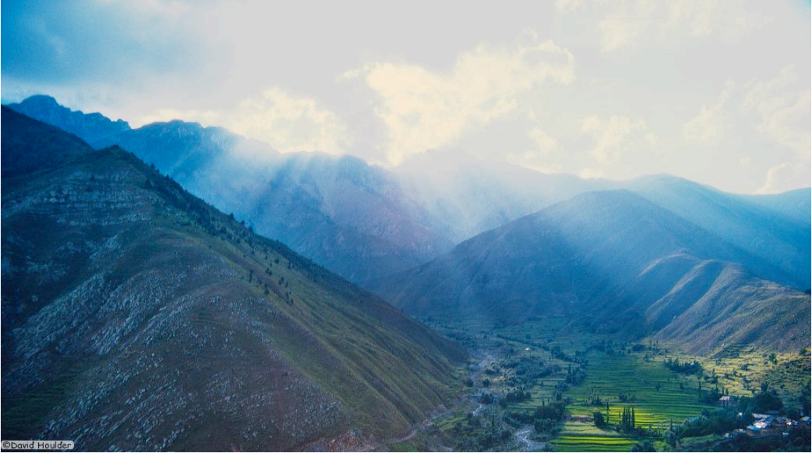
Shrinagar Valley, Kashmir

Radiant, Supreme Śhiva, consisting solely of the Light of Consciousness replete with absolute Bliss, simultaneously transcends the universe and embodies itself as the universe. From that perspective, all of existence...vibrates into manifestation as that Light, without any duality whatsoever. So in reality, there is no subject or object that is other; rather, it is simply Radiant, Supreme Śhiva that is vibrating and scintillating thus in thousands of various different forms.