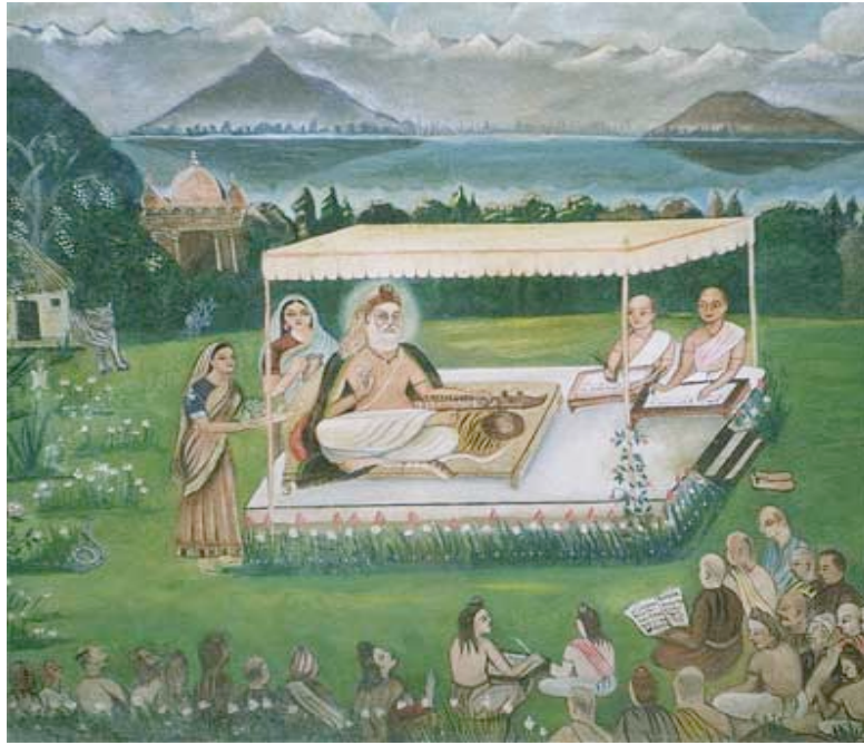
Abhinavagupta teaching before Lake Dal, Srinagar

In this very moment, you are everywhere, shining through me as your own graceful Śakti. O Great Lord! You have always been my heart alone! 'I' and 'you' are the same, for you are my very Soul!