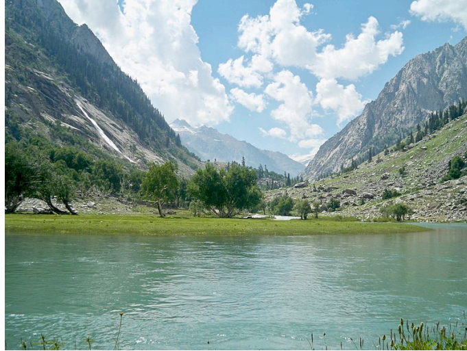
Swat Valley, Oḍḍiyāna, north of Kaśhmīr, birthplace of the Krama

The Nātha, after being taught in the sacred site where Om resonates (Uḍḍiyāna), was filled with compassion for living beings, and as the Promulgator [he] emitted the internal and external silence of ultimate reality as the corpus of the Krama. i